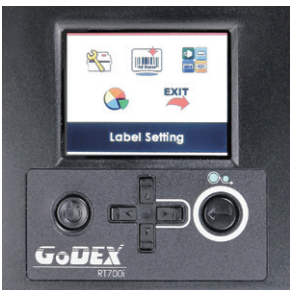
Color TFT LCD and operation panel for easy and intuitive operation

Full functions, powerful features, user friendly interface and high extensibility make the RT700i perfect for retail and industrial applications