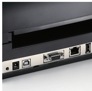
Ethernet, USB 2.0, Serial and USB host are standard features adding flexibility and power