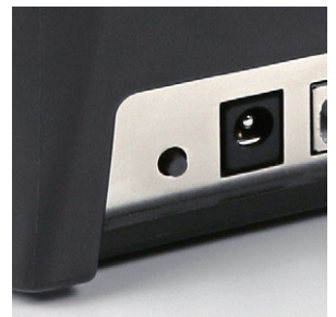
Innovative "C" button makes label Calibration simple and fast