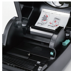
Rod-less label roll holder for easy loading and smooth feeding